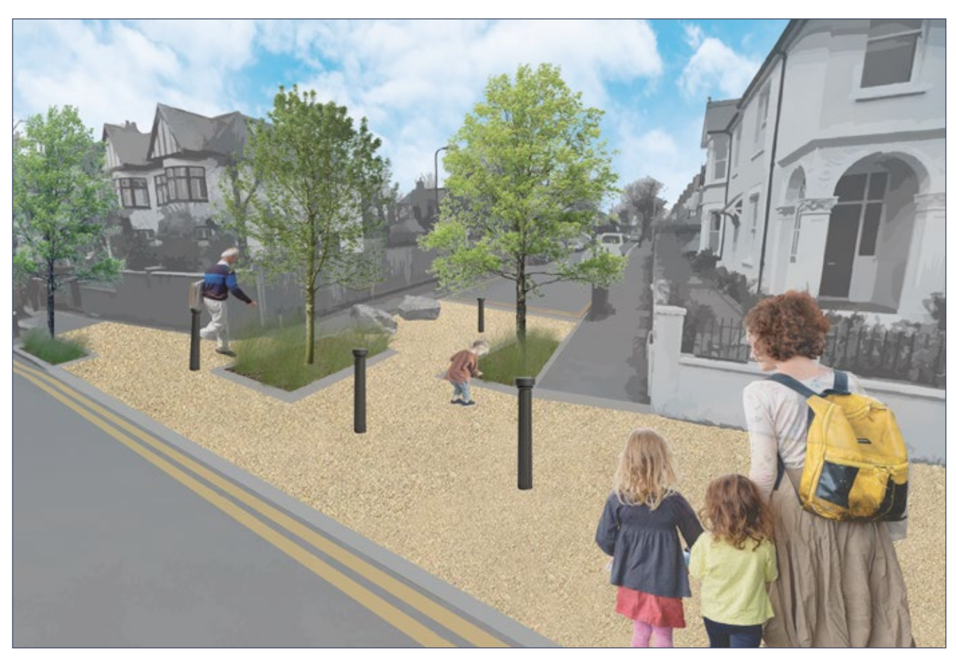
Example of a proposed public realm improvement